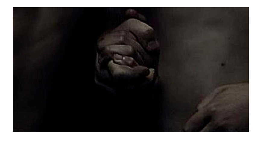
Figure 5 (a, b and c). In the gas chamber.