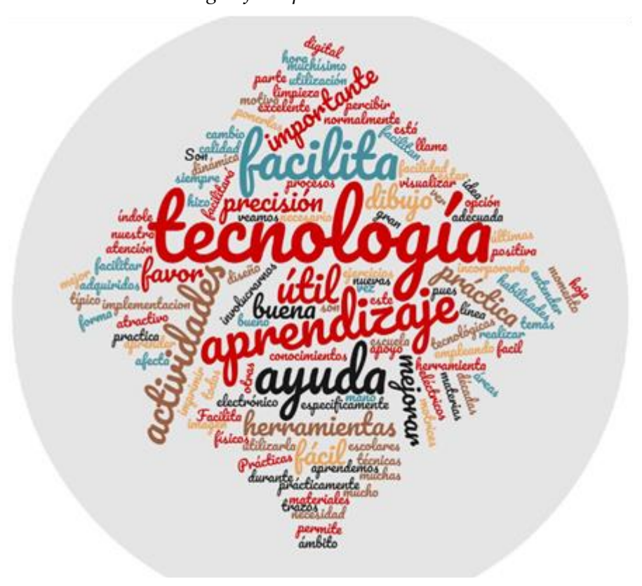
Figure 2. Word cloud on the use of technology in the flipped classroom.