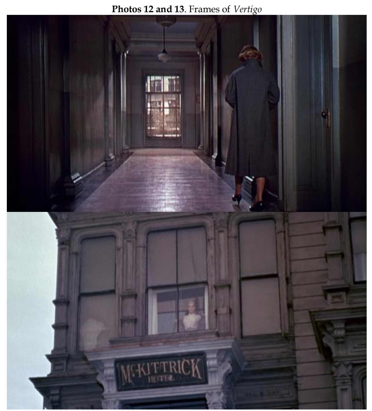
Alfred Hitchcock, 1958

much of homage as of reinvention or reinterpretation of the Hopperian modes, with a later route and trajectory, that yes, of great fortune in the world of the cinema.