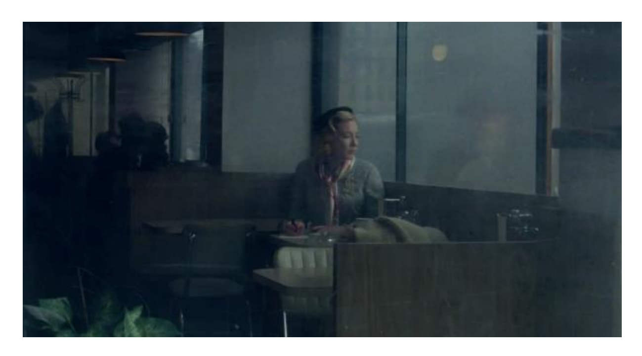
Todd Haynes, 2015

Terence Davies also recomposes a time in the family drama The Neon Bible (1995) with the aim of recreating, with a false and sugary wrapping, a concrete historical moment, that of the 1940s. The result cannot be, a chronicle but an evocation. In order to achieve this, he does not directly recreate Hopper's paintings but his style, as if he were mounting new paintings starting from the painter's own resources (figure 5). And again, despite the stylistic influence, Davies falls into the conventionalism of enhancing the sad aura of history, associating it with the melancholy that one wants to impose on Hopperian aesthetics. In this way, it is imperceptibly driven away from its belonging to the category which is now the subject of study in order to approach what we shall see later.