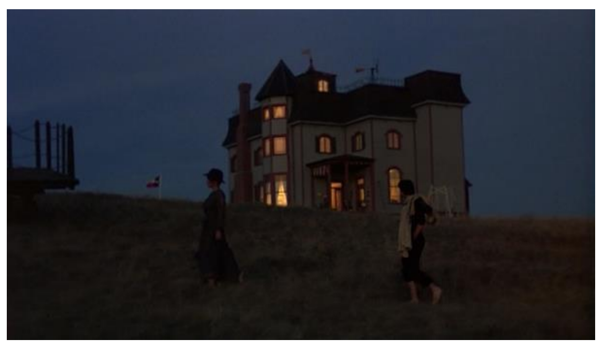
Terrence Malick, 1978

The list of filmmakers for whom Hopper's repertoire is an aesthetic milestone throughout his career is completed by David Lynch, several of whose films will be mentioned in this writing. One of the most literal in his use of Hopperian poetics is the customs story The Straight Story (1999), in particular in his calligraphic reflection of the pure American landscape, through which the look of the camera simply glances (the tractor in the feature film, Figure 8), without pretending to judge what he observes but without avoiding, either, to leave a sediment of solitude; an aftertaste that, on the other hand, is consubstantial with a country as vast as the protagonist, full of stories, more and more remote, of pilgrims, explorers and pioneers. There is, a priori, no social reading -neither of the artist nor of the traveler-in what are but a set of prints of a fraction of American reality, as in Hopper's canvases, although it is inevitable that, a posteriori, the spectator and the critic elaborate one or several interpretations (as in the paintings of the painter).