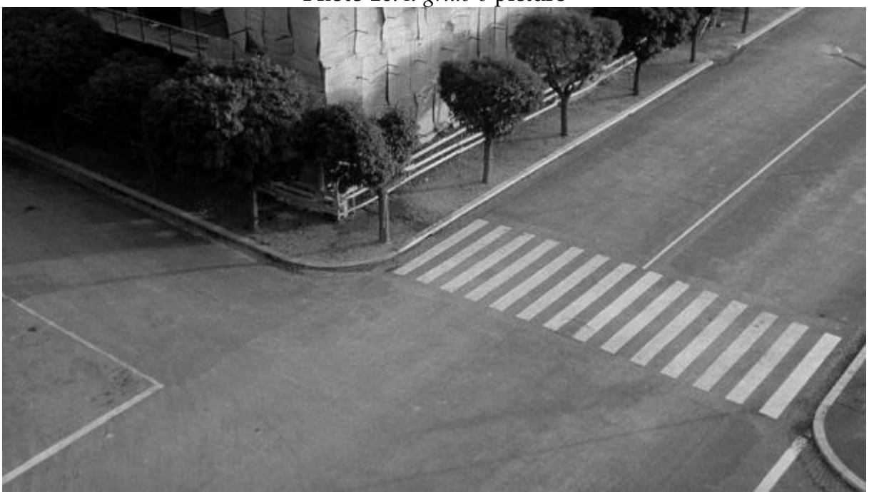
Michelangelo Antonioni, 1957