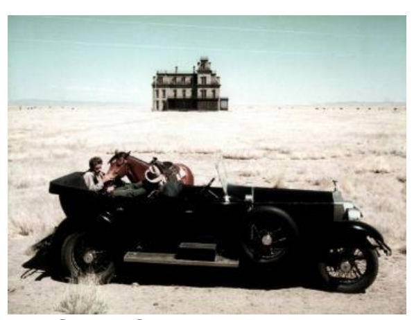
George Stevens, 1956

type, such as urban scenes devoid of life (figure 16) or in which the human figure is minimized by architecture (figure 17), chopped planes, characters looking to the horizon (especially women) and supported on walls, beds or windows or sitting indoors (figure 18). The truth is that in dealing with films with virtually no narrative plot and no resolution of the latter, with wandering dialogues or open endings, they could pass as extended and moving versions of Hopper's images. However, the fact is that all of them are overflown by a palate of fatalism that, remains commented, although it is usually associated with the work of the American painter, the truth is that to a large extent is due to the literary and critical pollution that it has added to him over time and, in short, has ended up imposing a biased reading of his works.