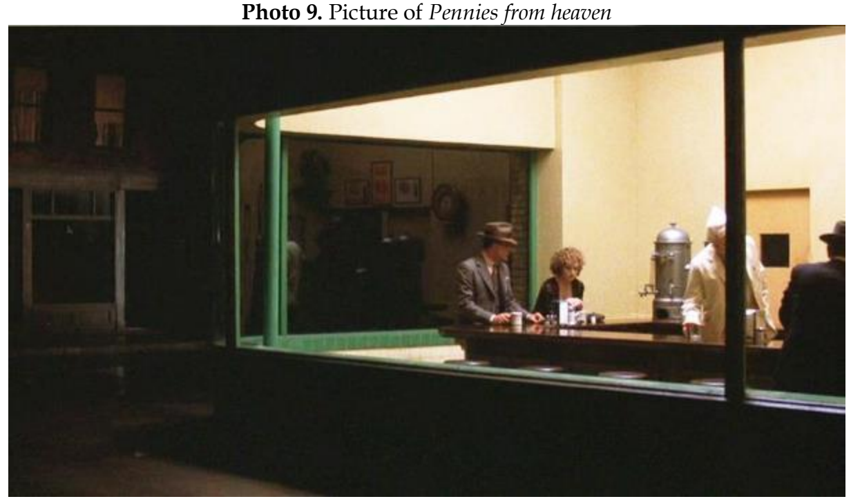
Herbert Ross, 1981

The aesthetic weight that Hopper leaves in the American cinema reaches the extreme that, in this category that we are shelling, it is possible to include a piece belonging to a genre, a priori, distant from those that are usually habitual when reproducing the Hopperian environments. It is the musical Pennies from Heaven (Herbert Ross, 1981), explicit homage to Hopper (through the reproduction of the Nighthawks' diner) (figure 9) and also to many of the topics of black cinema. Although the debts are obvious, the film behaves like a nostalgic exercise of sweetened memory of a time and an environment (those of the noir) that are seen with innocence at the same time that with candor. The society portrayed typically by the black genre represented the most abject of it, that is, men and women with whom no one would want to identify. However, the passage of time and cultural re-readings of their feature films have idealized these scenarios, promoting the fantasy of living as their sullen characters, wrapped in mystery and tormented by love or passion. In this sense, this potpourri of misrepresened references proposed by Pennies from Heaven ends unleashing a reading of Hopper's poetics very different from the one intended by the author, assuming a dangerous interpretation of an intention, in principle, pure.