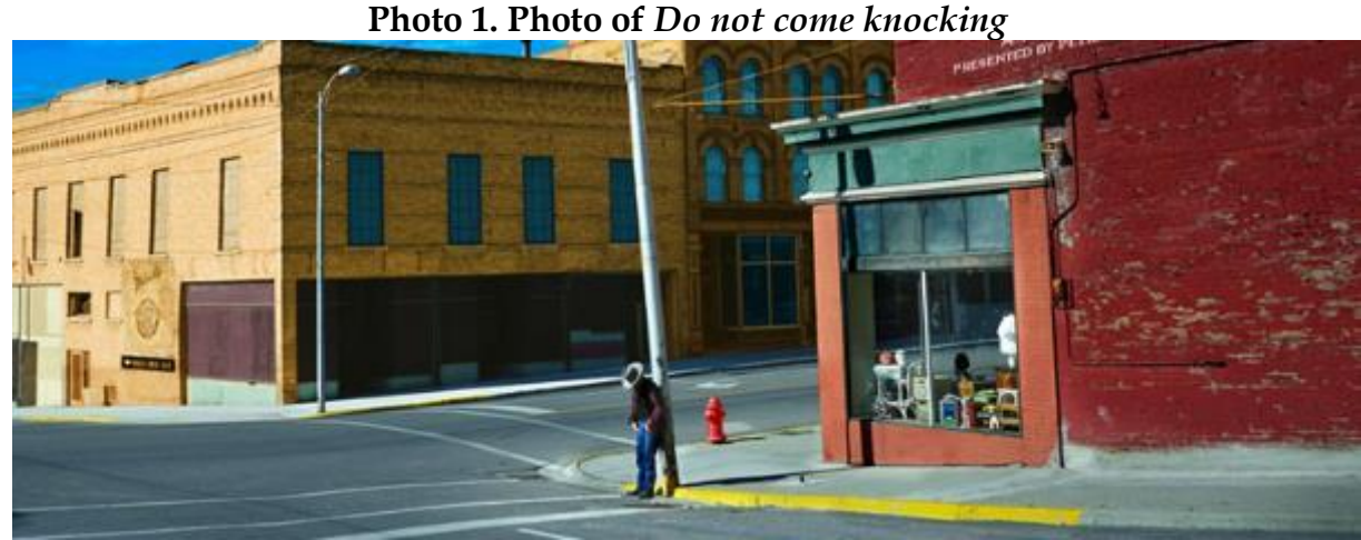
Wim Wenders, 2005

Despite the commented presence of Hopper's work as a starting point for several of Wenders' films, there is no doubt that the most faithful film to this cinematic-pictorial entente is Do not Come Knocking (2005), a dramatic genre film that is the maximum stylization of the tribute to Hopper by this filmmaker ( a tribute to Hopper in his own words) (Mamunes, 2011, p. 141). Here he copied both his way of composing the scenes and his chromatic intensifications (Figure 1), with a narrative that also lacks the obscure associations that are visible in other of his works, which gives more purity to the pictorial appropriation made in this time.