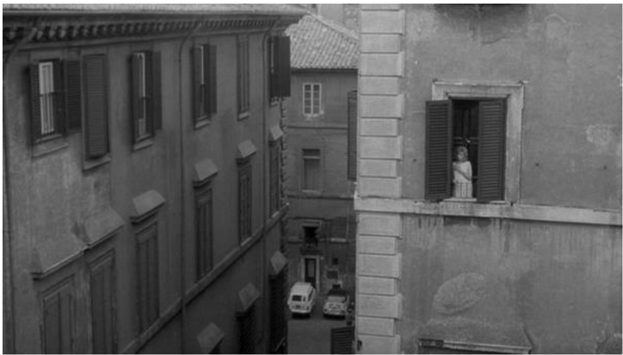
Michelangelo Antonioni, 1960