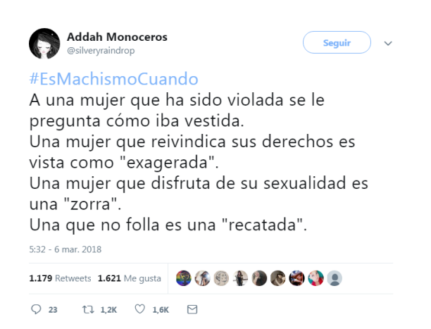
Figure 6: Tweet posted using the hashtag #EsMachismoCuando

However, in the 8M strike, their main weapon was Twitter. Two days after the feminist call, thousands of tweets turned the hashtag #EsMachismoCuando (See Figure 6) into the main trending topic at a national level. The little bird's social network was filled with stories of women denouncing the patriarchal behaviors they have to endure daily, but also comments from users who disapproved of this "through incitement, and even trolls who, with insults and contempt, have shown how necessary this debate is" (Público, 2018).