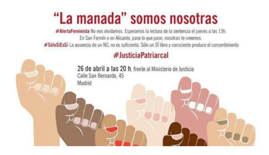
Figure 2: Call for the demonstration "'La manada' somos nosotras"

The critical point of this process occurred on April 26, 2018, when justice sentenced the five members of "La Manada" to 9 years in prison over the crime of continuous sexual abuse and not for rape, even with a particular vote in favor of acquittal. The verdict provoked great outrage in the Spanish society, and to make it noticeable, they organized dozens of mass meetings in different locations of Spain under the slogan "La manada somos nosotras" [We are "the pack"] (See Figure 2).