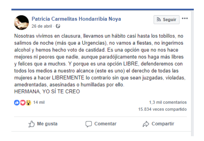
Figure 3: Carmelitas Descalzas of Hondarribia Facebook post

This hashtag had such a social impact that even the Carmelitas Descalzas nuns of Hondarribia (Guipúzcoa) joined and used it in a moving message that generated more than 1,300 comments, 14,000 reactions, and was shared more than 15,000 times (See Figure 3).