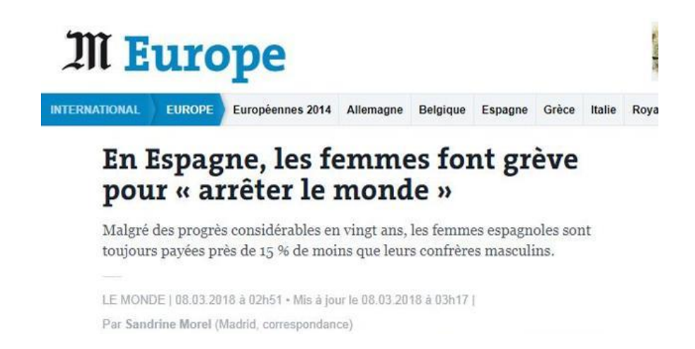
Figure 5: Piece of news published by Le Monde

Meanwhile, The Washington Post (2018) pointed out women's claim "to protest unfair wages and domestic violence by collective banging on pots", while The New York Times (2018) published a special piece titled "International Women's Day 2018: Beyond #MeToo, With Pride, Protests and Pressure", highlighting women's labor and domestic strike.