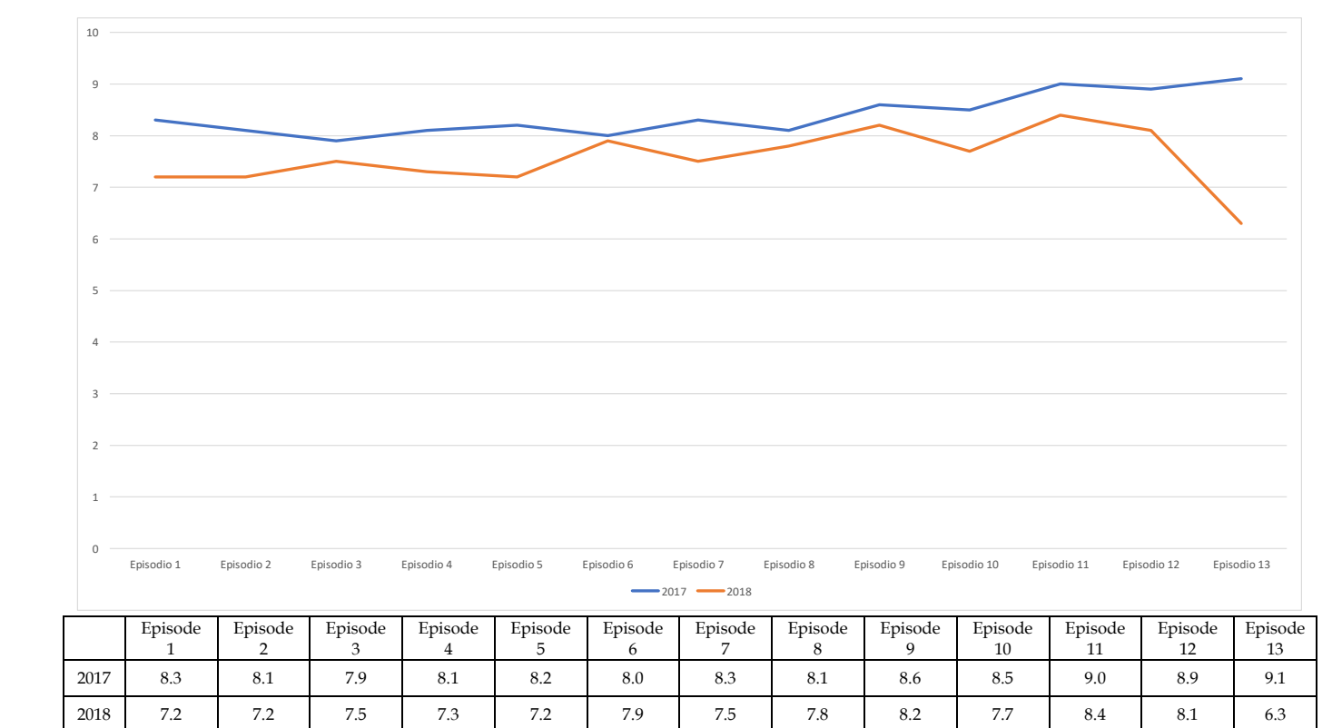
Graph 2: Comparison of the ratings of the episodes of the first and second season. The IMDb Parent Guide rates the following categories: Sex & Nudity (severe), Violence & Gore (severe), Profanity (severe), Alcohol, Drugs & Smoking (moderate), Frightening & Intense Scenes (severe). Consultation made: July 10th, 2019.